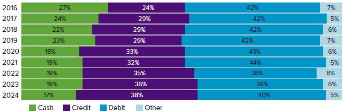
Figure 4: Share of consumers' preferred payment instruments for in-person payments